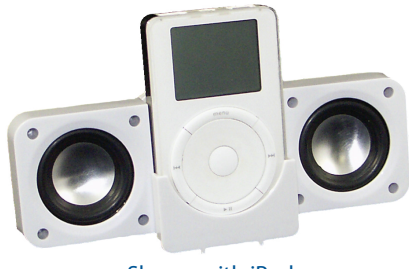
Shown with iPod (iPod not included) Fig. 7