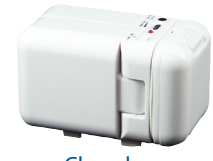
Closed Fig. 7