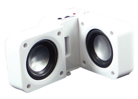
Half Opened Fig. 7